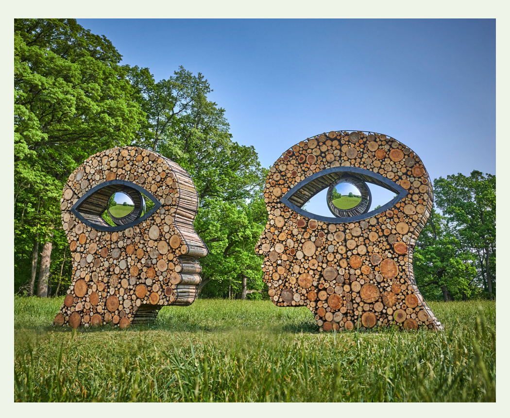
Mind Eye (2023) by Olga Ziemska Locally reclaimed wood logs, metal armature Morton Arboretum