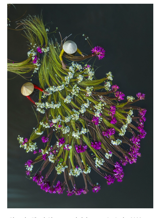
awarded the top prize in the 2023 DJI Sky Pixel Aerial Photography Awards