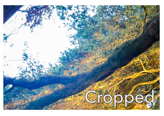
When you look at just a minimal crop, the blurriness is easy to see.