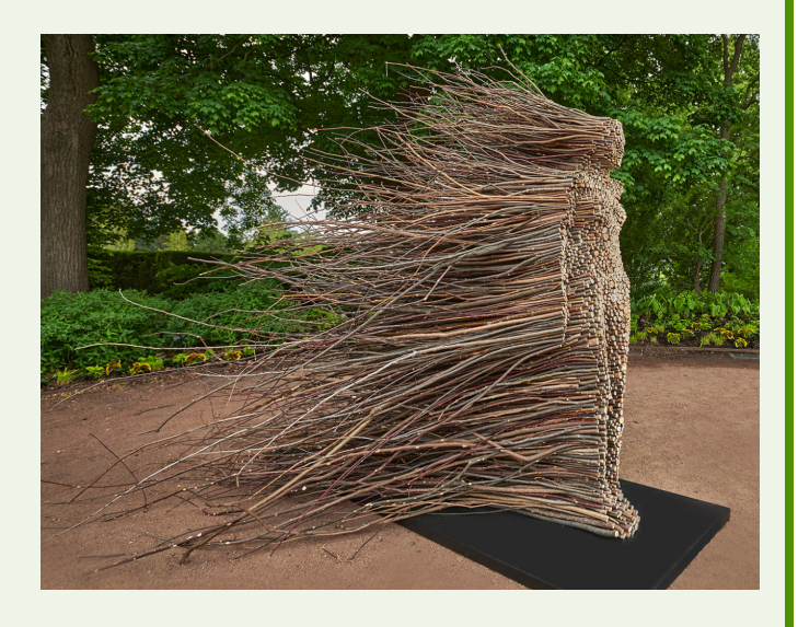
Stillness in Motion (2023) by Olga Ziemska Locally reclaimed branches, wire, metal armature Morton Arboretum

The artist's work will be created from reclaimed tree branches and other natural materials gathered from various locations throughout the Arboretum's 1,700 acres. "I am giving reclaimed natural materials a new life and transforming them from nature into new forms," Ziemska said.