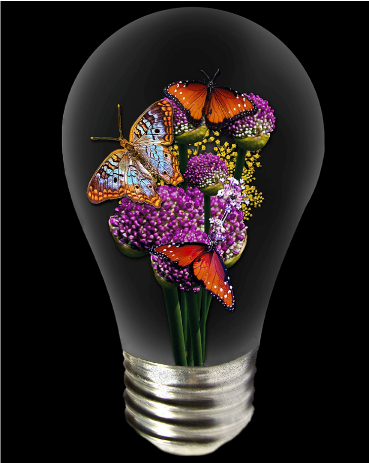
Butterfly Flower Light Bulb Color Image by Tom Hughes Award