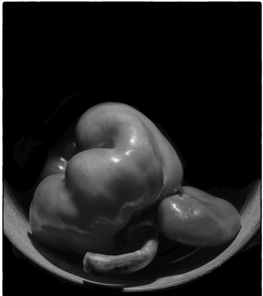
Pepper Monochrome Honorable Mention