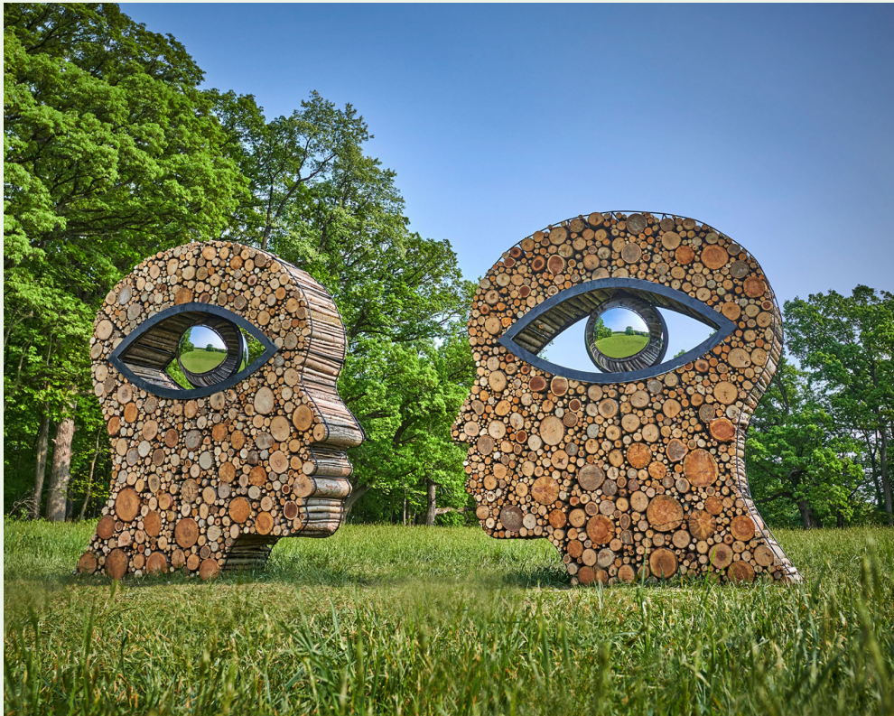
Mind Eye (2023) by Olga Ziemska Locally reclaimed wood logs, metal armature Morton Arboretum