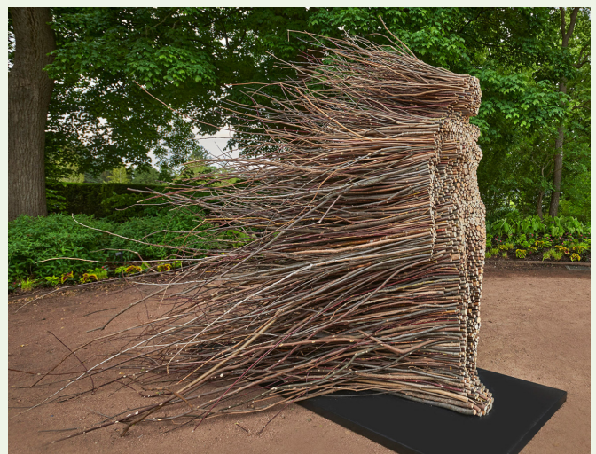
Stillness in Motion (2023) by Olga Ziemska Locally reclaimed branches, wire, metal armature Morton Arboretum

The artist's work will be created from reclaimed tree branches and other natural materials gathered from various locations throughout the Arboretum's 1,700 acres. "I am giving reclaimed natural materials a new life and transforming them from nature into new forms," Ziemska said.